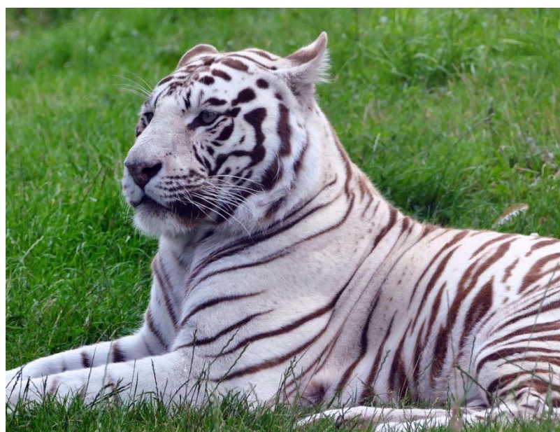
Learn about lions, tigers, caracals, wild dogs, Hyenas and more with a qualified ranger guide.