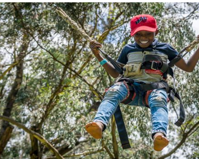
Take fun to a higher level with Chameleon Village Bungee Bounce.