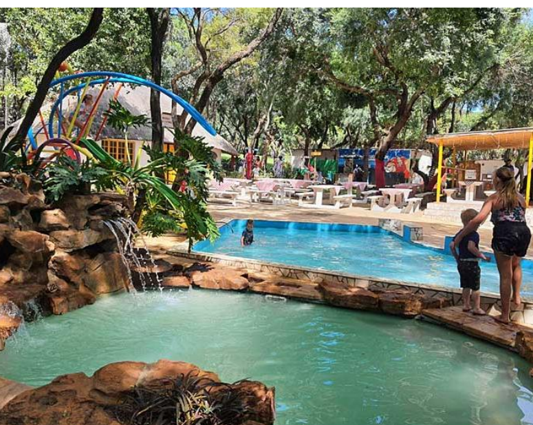
Splashing good times at the water play park with beach areas and swimming pools.