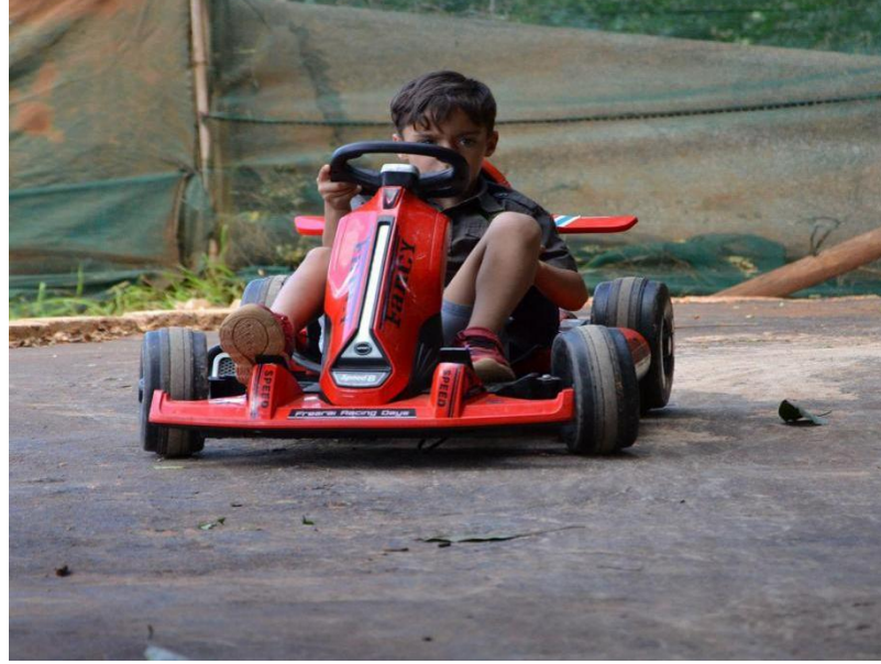
Adventure Freaks is a unique adventure park which provides fun and memories for the family.