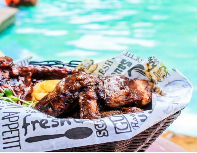
From wood-fired pizzas to authentic flame grill, there is a diverse array of restaurants.