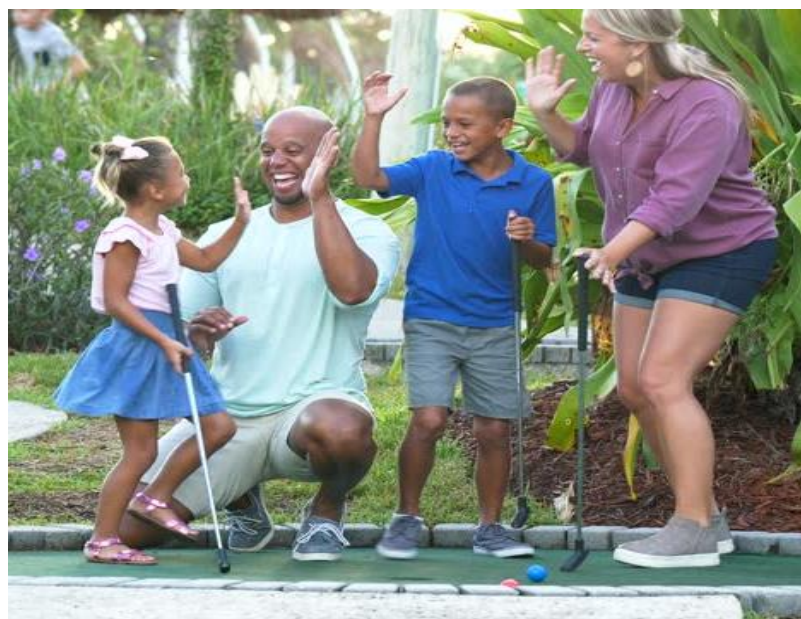
Play mini-golf at the beautifully gardened and Shaded18-hole putt-putt course for all ages.