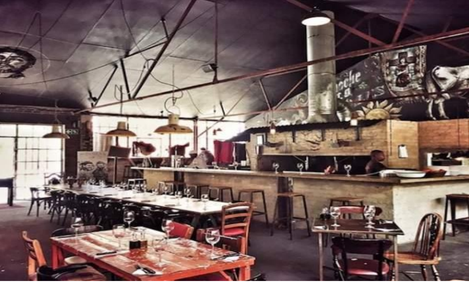
Lunch at Che Argentine Grill in Parkwood for some authentic Argentinian Chesa Nyama.

After lunch we continue with our history lesson at James Hall Museum of Transport. What to see: